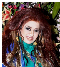
By: Shahnaz Husain

The lips, like the eyes, add character to the face. They are the focus of attention when we speak. The lips also add balance to the face, along with other facial features like the eyes and the nose. As far as beauty is concerned, appropriate lip makeup can enhance the beauty of the face. In winter, keeping the skin of the lips soft and smooth can present a problem due to the lack of moisture and the effect of lip makeup.